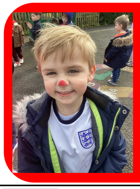
Together we've raised over £280 for Comic Relief. Thank you!